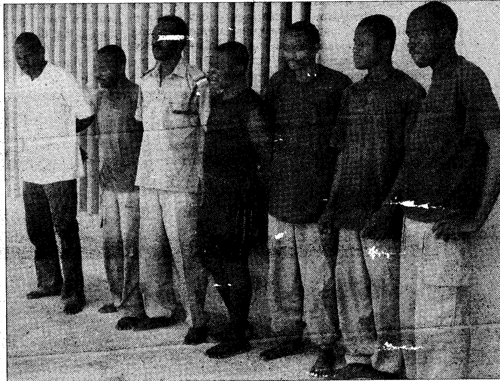
Suspected immigration officers in police net