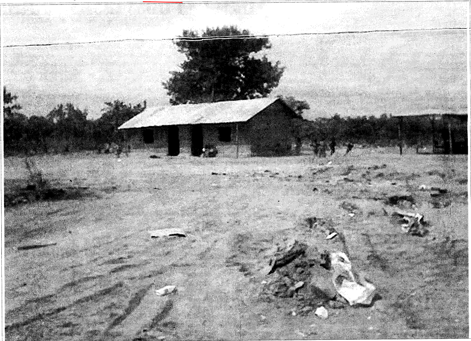
LEA Primary School; one of the structures that survived FCTA's bulldozers recently at Gishiri.

At the Gwagwalada police station, a policeman who confirmed the three deaths disclosed that investigations were still in progress to apprehend those behind the killings.