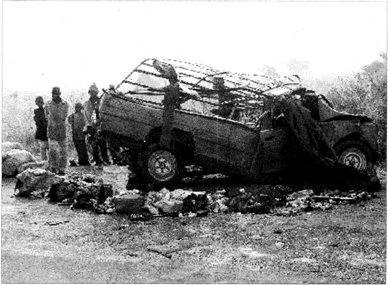
Personal effects of the victims litter the scene of the accident

Our Correspondent who visited the scene of the accident gathered that six of the victims including an infant whose mother survived the accident died instantly while the other who sustained