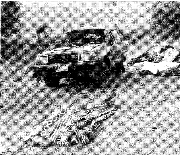
The bodies of six members of one family that perished in the accident