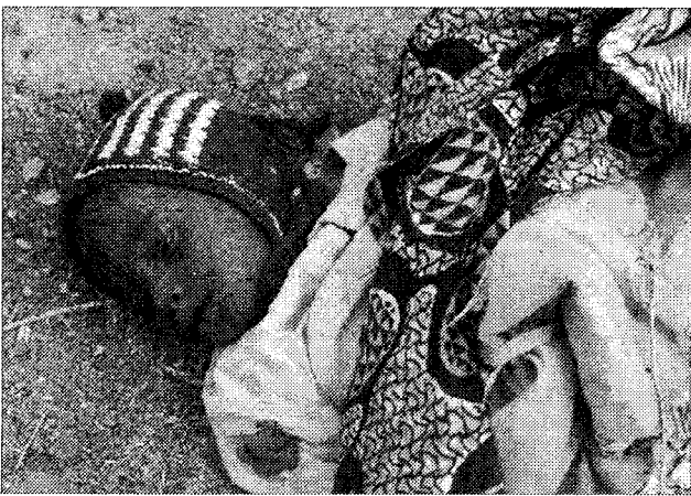
12 months old baby that died along with her mother in the crash