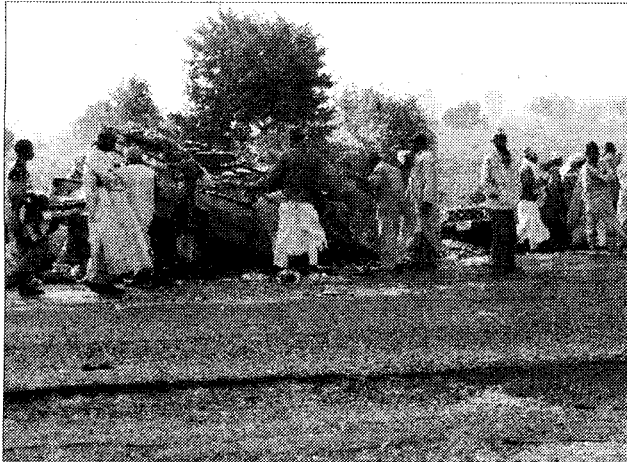
A Sallah Holiday than ended in a tragedy for a family of six on their way to Ilorin

Some will slow down but as soon as they see the dead