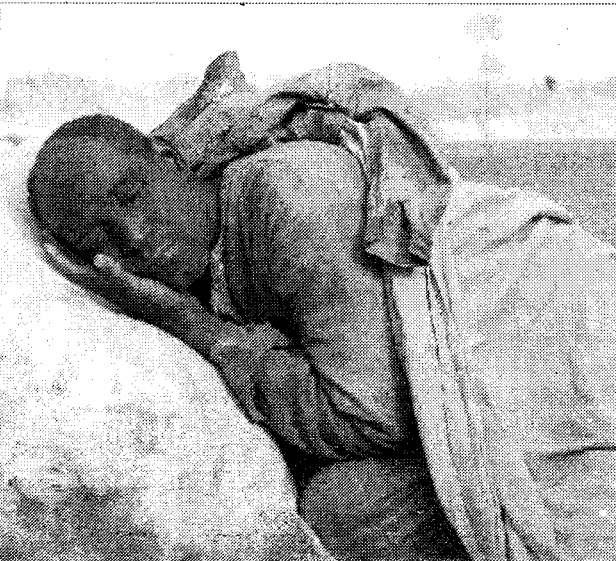
One of the few survivors of the crash