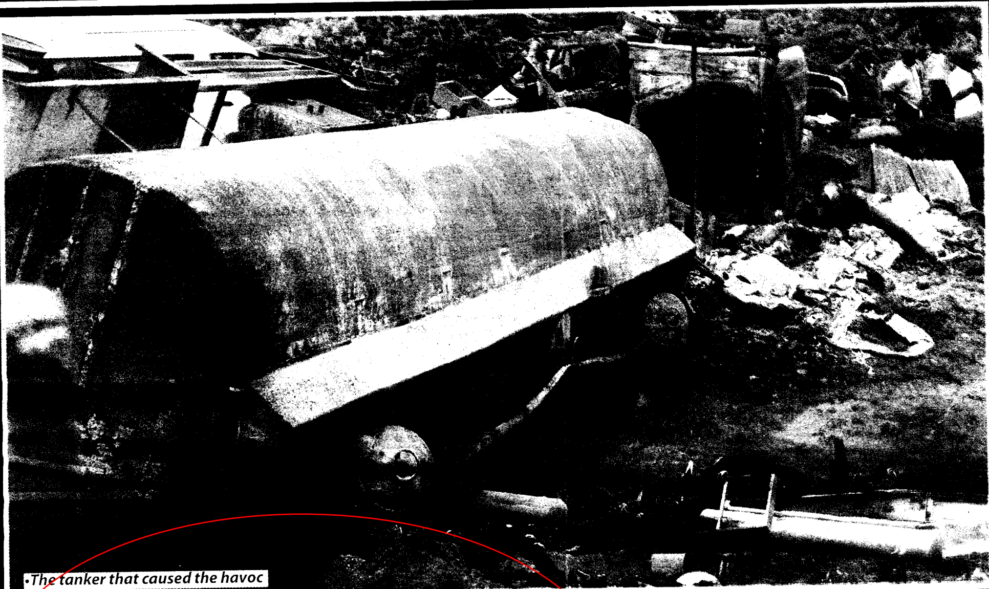
The tanker that caused the havoc