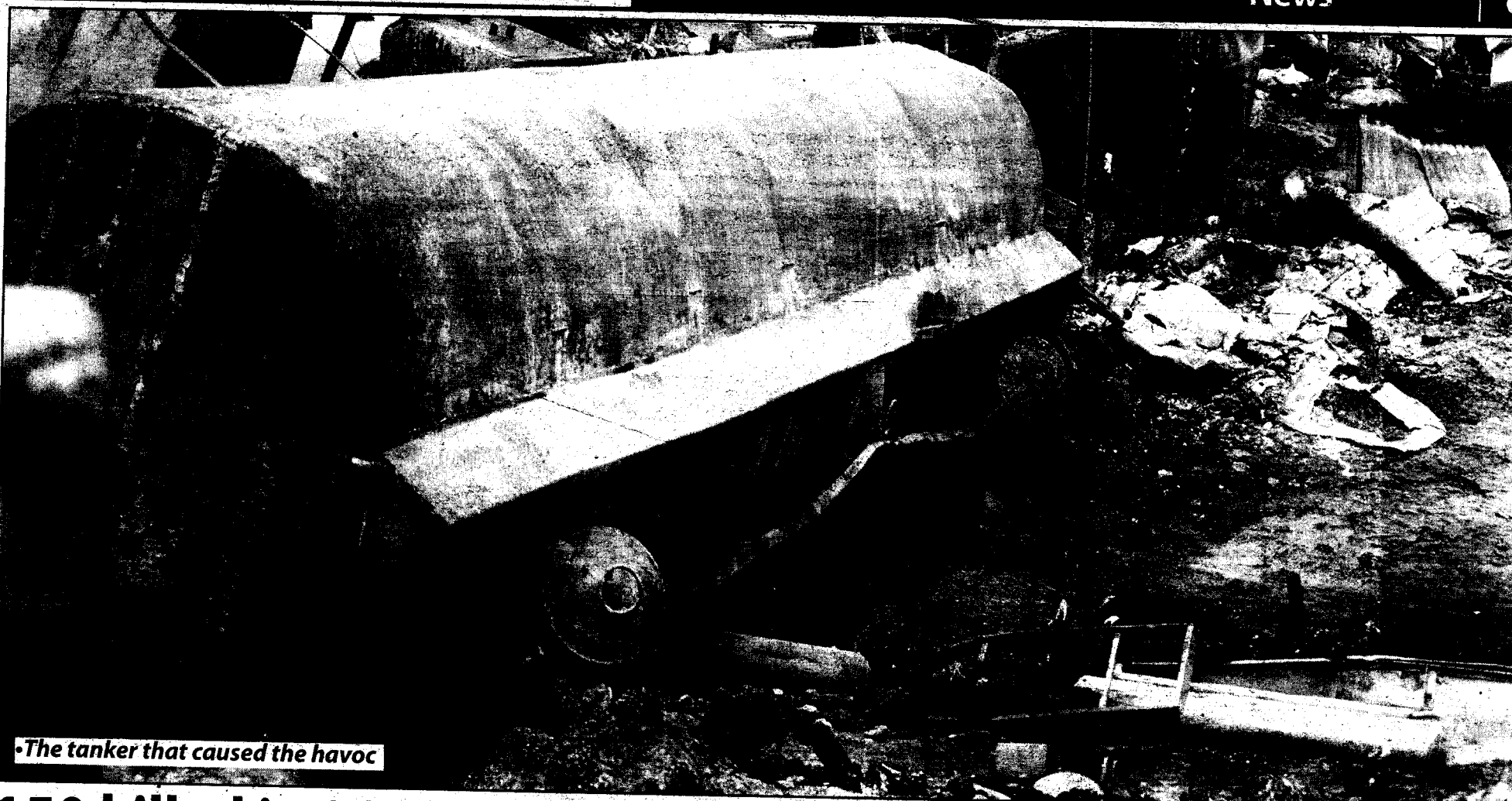
•The tanker that caused the havoc