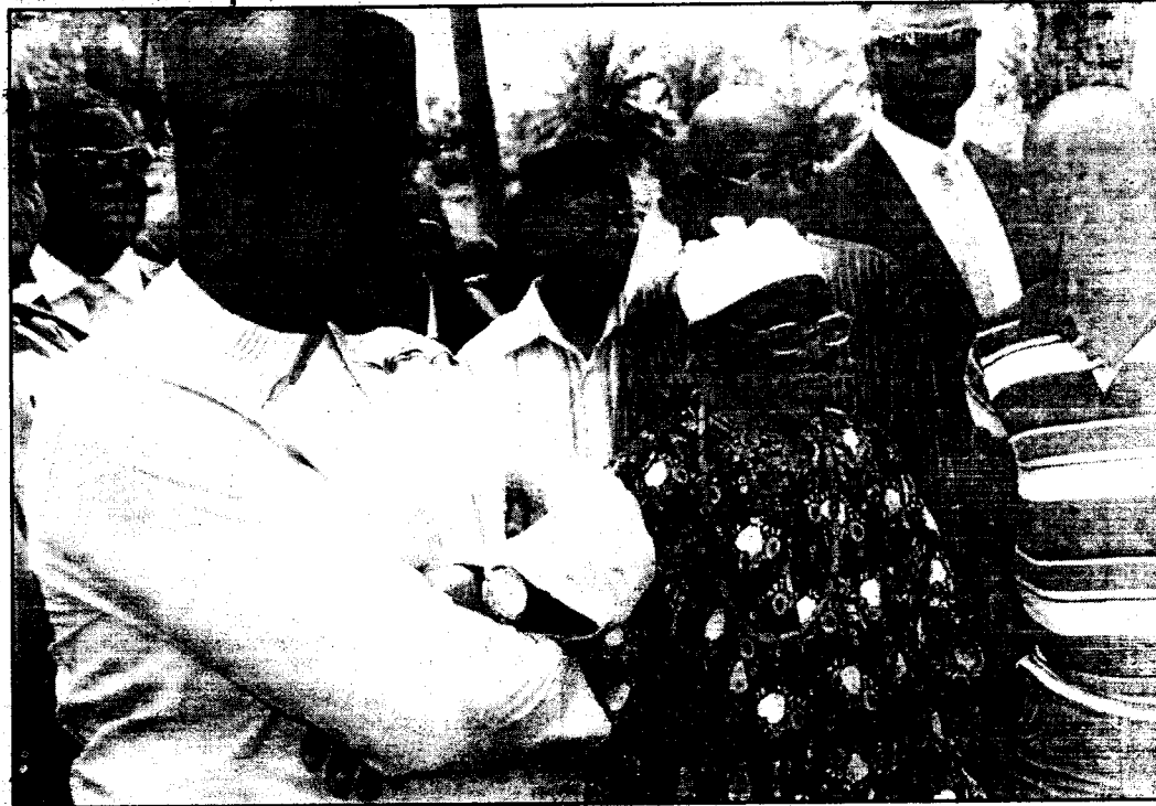
Imo State Governor, Owelle Rochas Okorocha during a sympathy visit to the Njoku family in Umuakuru Government Area over death of 9 members of their relations. With him are the only survival relations, Traditional Ruler of Umuakuru Autonomous Community HRH EZE Cyril Njoku.