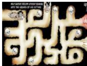
Gaddafi Family Has Reportedly Fled Libya