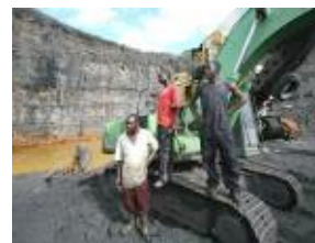
Zambia: Mines Ministry to Issue 800 Mining Licences

Gaddafi Not in Burkina Faso -Ambassador Pfizer - Fresh Legal Battle Looms Govt Secures N2.2 Trillion Investment Commitment for Non-Oil Sector