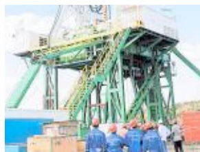
Kenya Plans Geothermal Deal With Chinese Firm