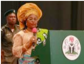
No Case Against Nigerian First Lady - Crimes Commission