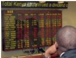
Nairobi Stock Exchange Ranked Worst Performing in Africa