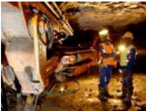
Zimbabwean Mines Face Closure by Government