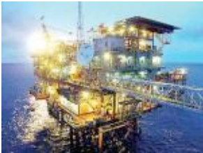
South Sudan to Diversify Economic Sector