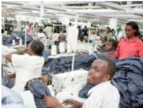
Employers in Ghana Breaking Labour Laws?