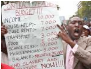
No Money Says Kenyan Govt as Teachers' Strike Continues