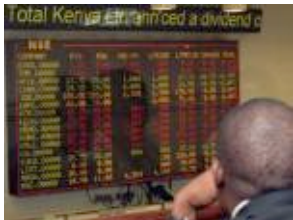
Nairobi Stock Exchange Ranked Worst Performing in Africa