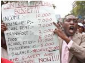
No Money Says Kenyan Govt as Teachers' Strike Continues