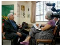
South Africa Wary of Monetary Fund's Proposed Bank Tax