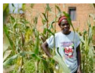
Small-Scale Farmers Battle to Stay Alive in Angola