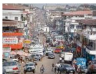
Liberia's President Faces 2011 Elections Challenges