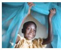
World Must Retain Focus on Anti-Malaria Fight, Says Expert