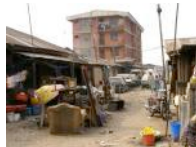
Construction Players Benefit from Strong Demand in Nigeria