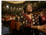
President Sirleaf Upbeat about Foreign Investment in Liberia