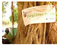
Southern Sudan Could Open 'Corridor of Terror', Says West