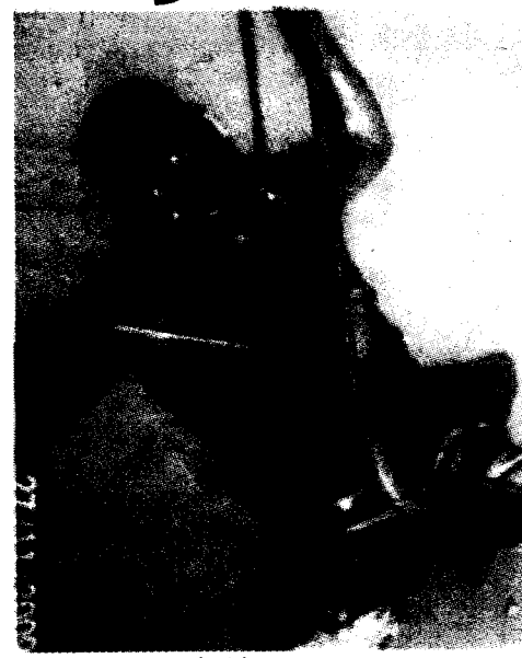
• Suspect arrested with gun

sustained severe machete cuts are recuperating at the Federal Medical Centre, at the area.