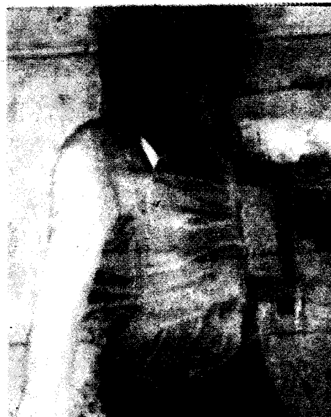
• Lifeless victim

Medical experts are still battling to save their lives at hospitals in the area while others who