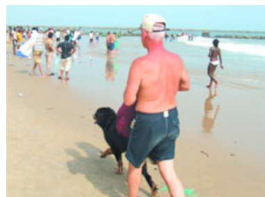
Holiday makers at the beach