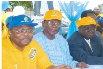
(l-r) Afribank Plc MD/CEO...