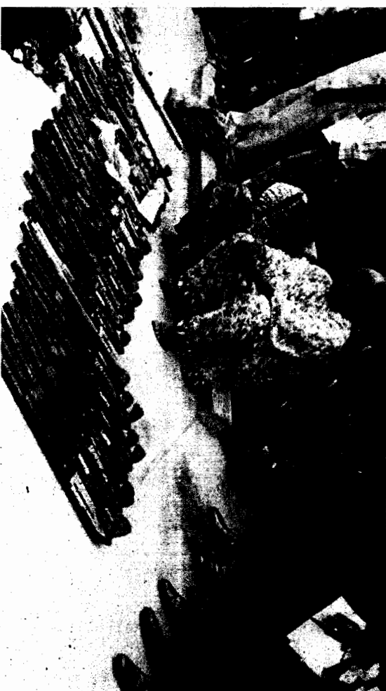
• Suspects and their weapons

It was at this stage, the eye witnesses said, the policemen started to fire at the surging demonstrators and a woman who was passing by was shot and killed. This annoyed the demonstrators the more and they put the woman's corpse in a wheel-barrow and went round the streets of Aba. As they went they made bonfire at major junctions and roads, chanting war songs.