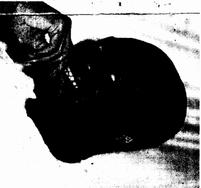
• Gov. Oji Uzor Kalu of Abia State

The armed robbery attacks were targeted at banks mostly as there was no day three or four banks were not robbed. Other targets, according to check were filling stations, super markets, big restaurants and luxury buses.