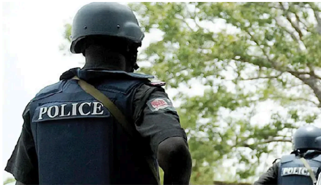
A Nigerian Police Officer