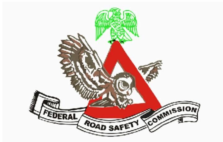
Federal Road Safety Commission