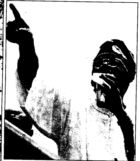
• Governor Tinubu on the scene... yesterday.

Tinubu: 'You have done a great work. All the personnel are here. We will prosecute the developer; he cannot run away. We will also enact laws to punish those who don't comply with building standards'