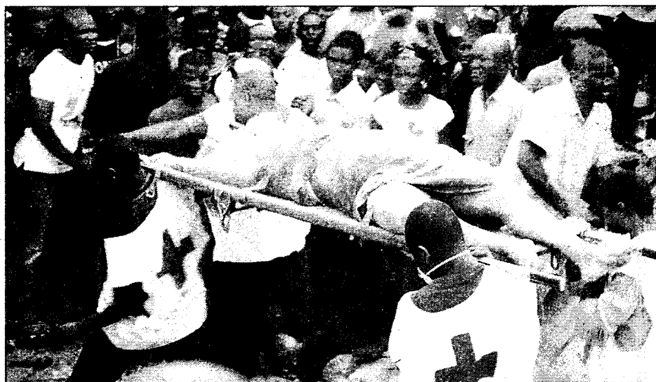
• Another victim being taken away from the scene ... yesterday.