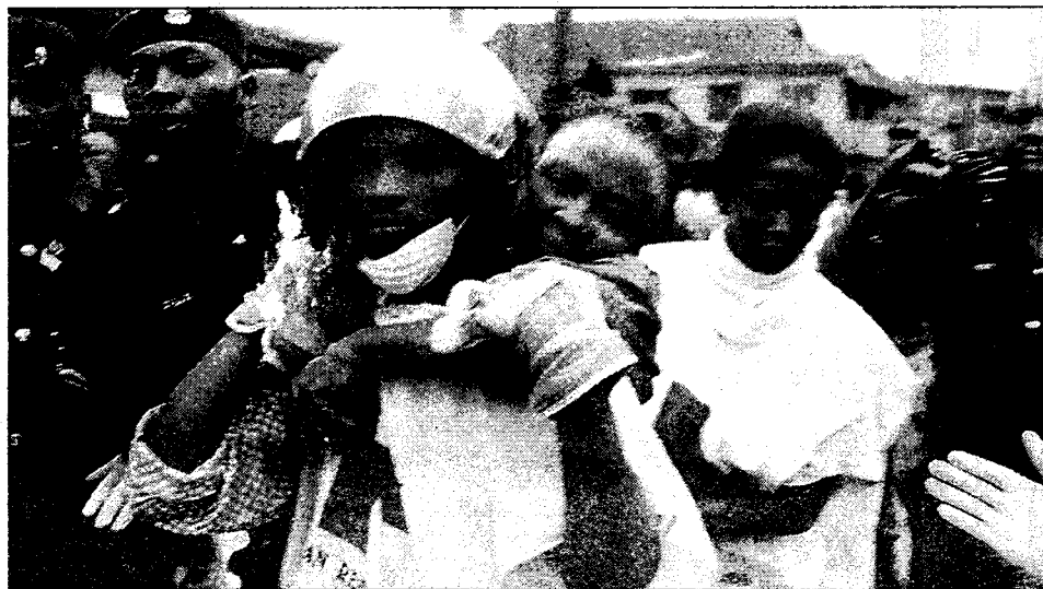
• An old woman survivor been taken to the hospital