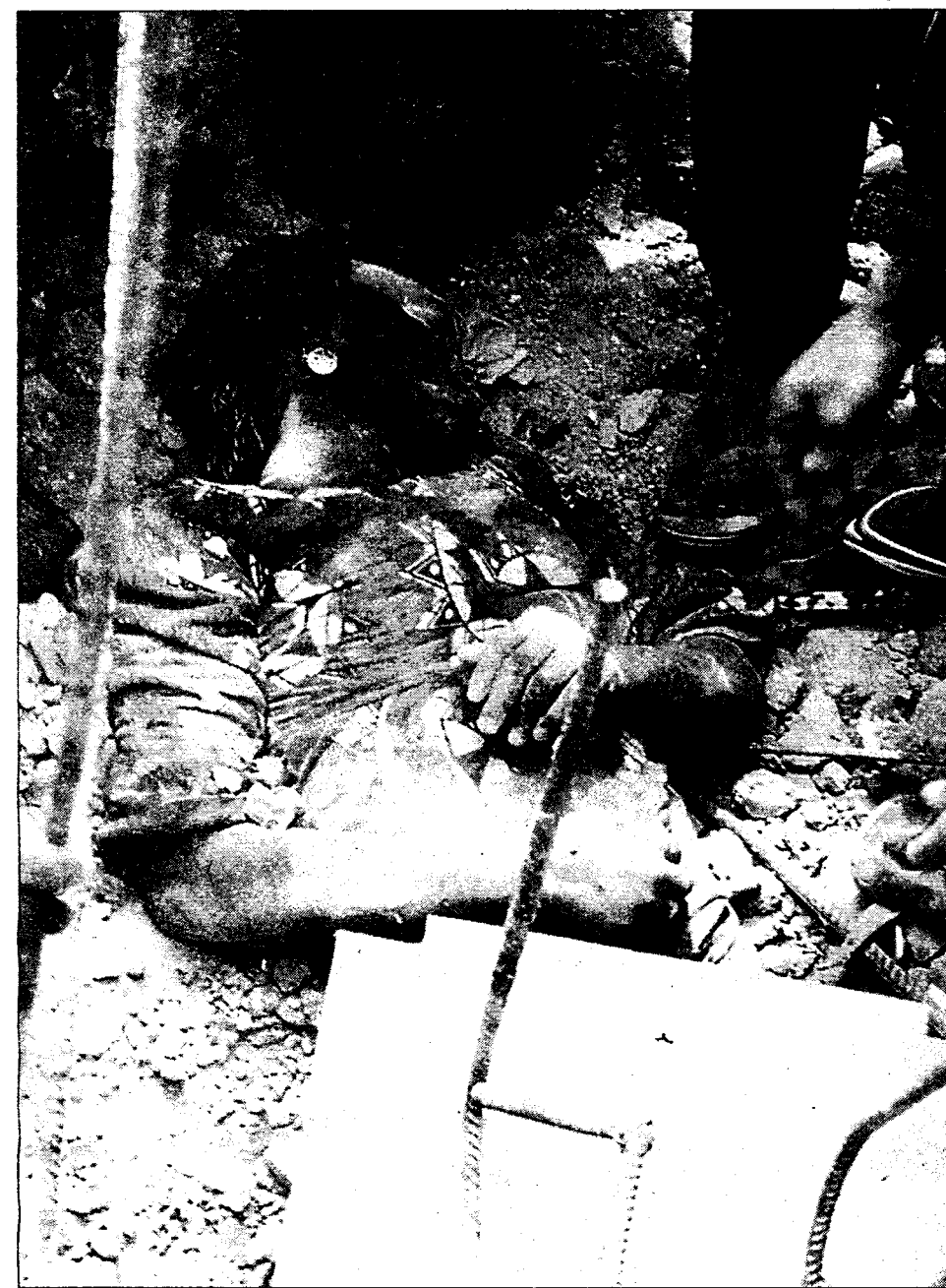
• One of the survivors ... yesterday.