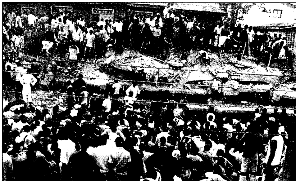
• Sympathisers standing on the collapsed building.