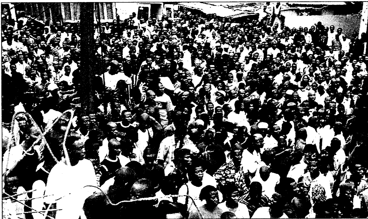
• Sympathisers at the scene.