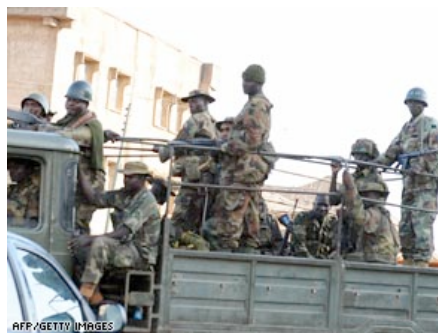
Soldiers patrol the streets in Jos after the riots.

JOS, Nigeria (CNN) -- Calm returned to Jos on Monday as hordes of police and military personnel descended on the central Nigerian city to enforce order after three days of deadly Christian-Muslim riots.