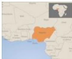
Nigeria, West Africa (Click to Enlarge)

The strike on MV Red One at around 3 a.m. (0200 GMT) off the coast of southern Nigeria's Akwa Ibom state was the latest in a series of attacks on the country's deep water oil industry.