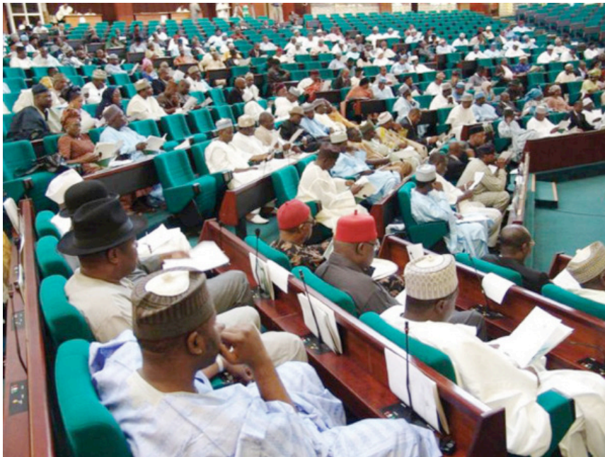
Elections in April will need security.

home news money opinion arts & culture sport sms x2 élan faith advertise national metro world crime economy elections environment politics military