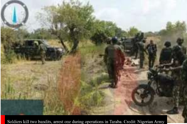
Soldiers kill two bandits, arrest one during operations in Taraba.