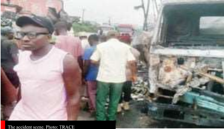
The accident scene.