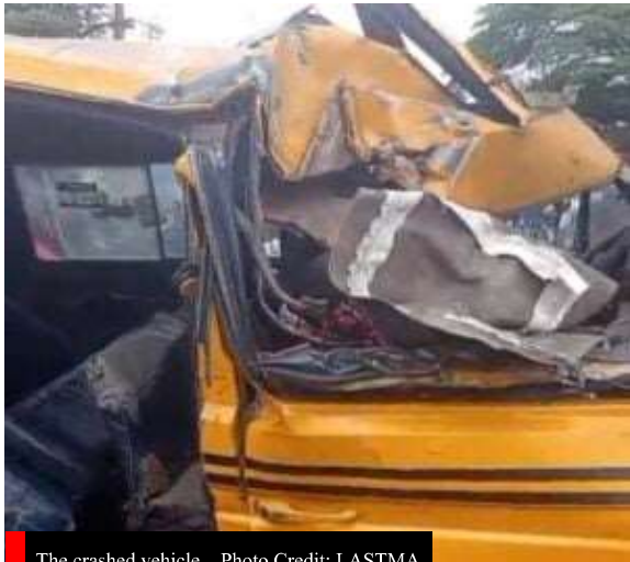
The crashed vehicle...