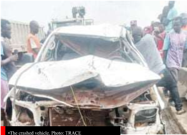
•The crashed vehicle.