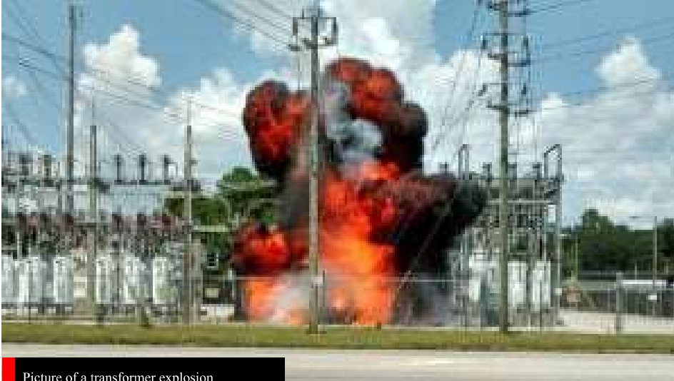
Picture of a transformer explosion