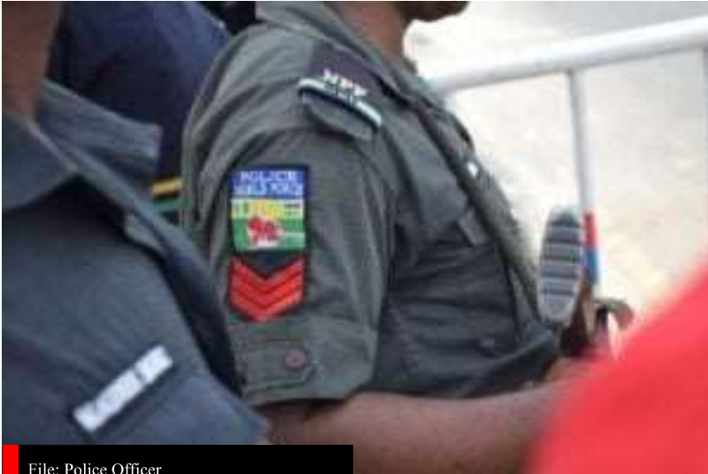
File: Police Officer