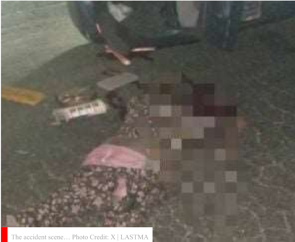
The accident scene...