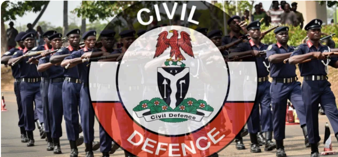
Nigeria Security and Civil Defence Corps (NSCDC)