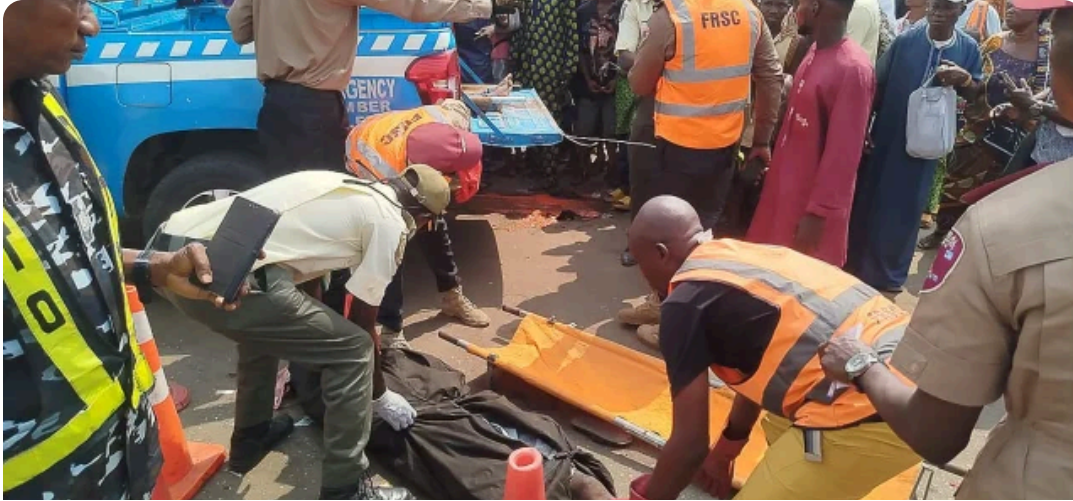
Scene of the crash

Three persons have died in a multiple-vehicle crash at the Toll Gate area of the Lagos–Abeokuta Expressway in Ogun State.