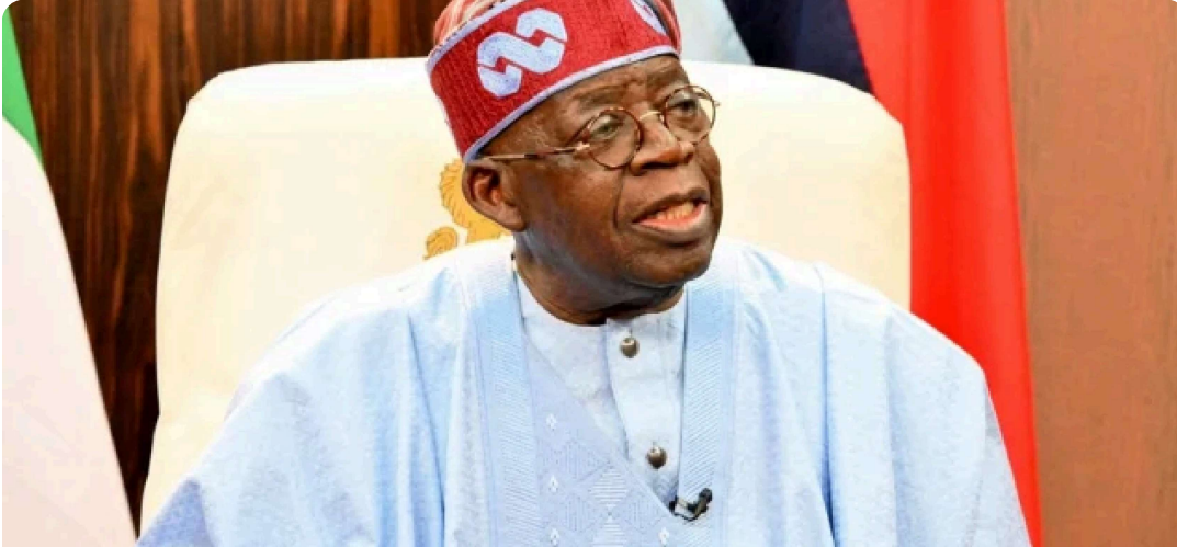
President Bola Ahmed Tinubu

The air component of the Northeast Joint Task Force under Operation Hadin Kai (OPHK) has killed 50 Boko Haram and Islamic State West Africa Province (ISWAP) terrorists in the border community of Ngoshe in Gwoza Local Council of Borno State.