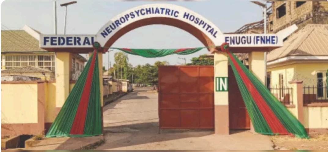
Federal Neuropsychiatric Hospital, Enugu