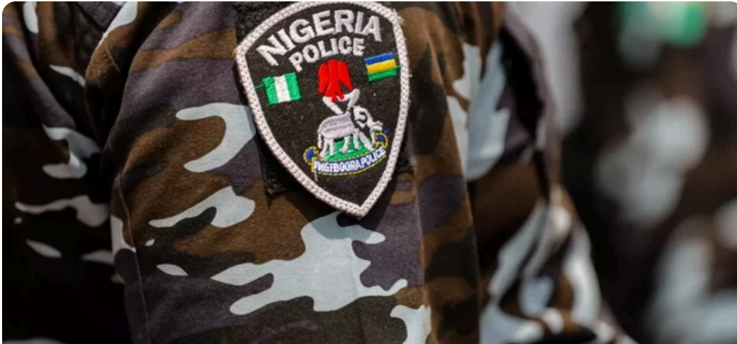
Nigeria Police Force