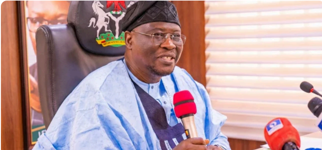
Adamawa State Governor, Ahmadu Umaru Fintiri

Governor Ahmadu Umaru Fintiri of Adamawa State has condemned the recent attacks on communities in Madagali and Hong local government councils of the state, describing them as cowardly acts of terrorism that will not be tolerated.