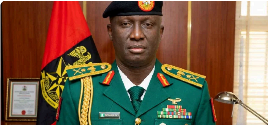
Chief of Army Staff (COAS), Lt.-Gen. Waidi Shaibu

The police in Ogun State have launched an investigation into the death of a man during a clash between enforcement officials of the Ogun State Ministry of Physical Planning and Urban Development and military personnel over the demolition of illegal structures in Orile-Imo, Obafemi-Owode Local Council.