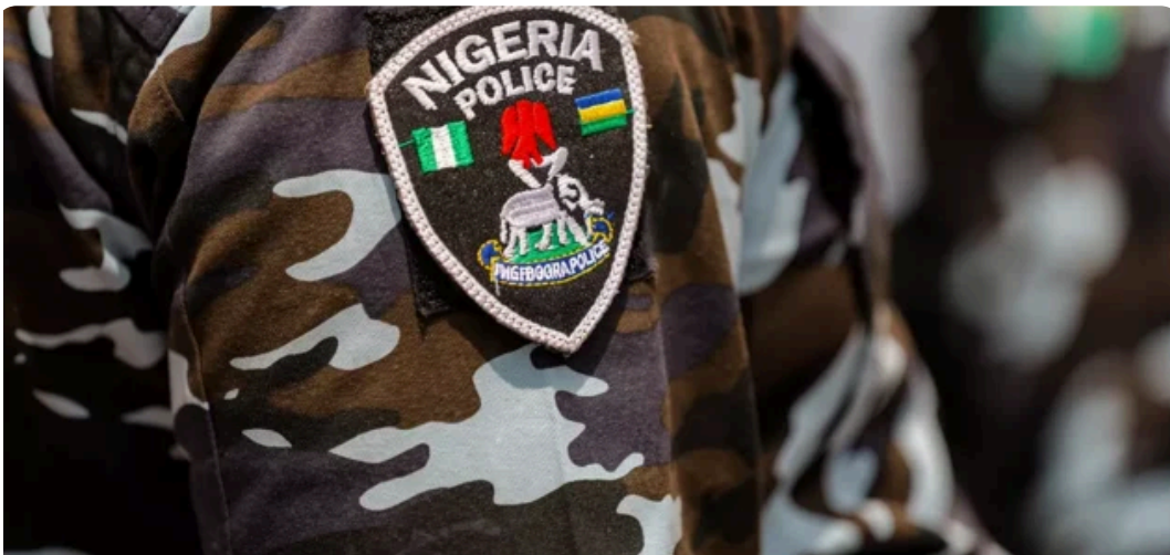
Nigeria Police Force