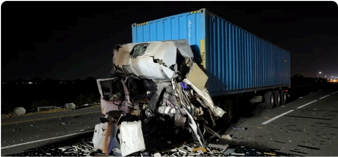
Accident along the Cele inward axis of Oshodi–Apapa Expressway at Mile 2, Lagos

A truck driver and another man have died in a fatal road crash involving two fully laden 40-foot containerised trucks along the Cele inward axis of the Oshodi–Apapa Expressway at Mile 2, Lagos.