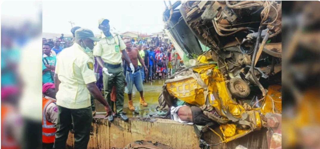
Scene of Ogun accident

At least six persons have been confirmed dead, while others sustained injuries in a road crash along the Makurdi- Gboko Highway in Tarka Local Council of Benue State .