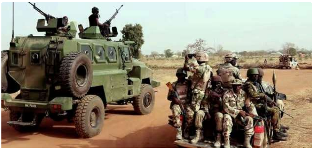
Nigerian Army