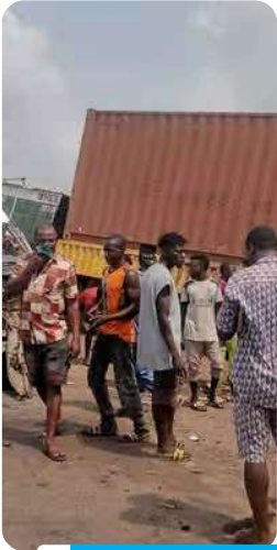
Scene of the crash

Many were feared dead in a multiple road crash involving about 10 vehicles along Enugu/Port Harcourt highway yesterday afternoon.