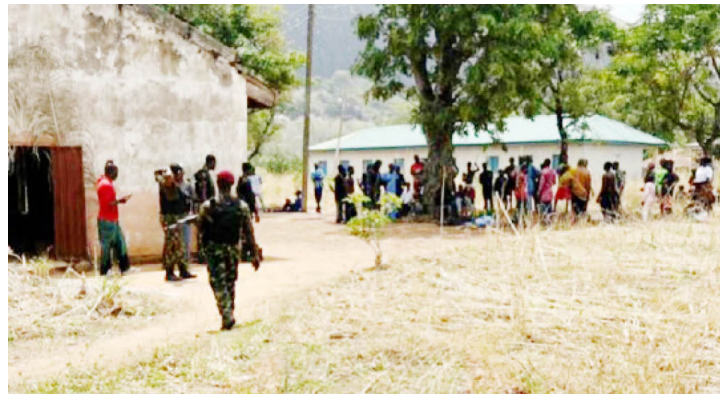
Residents of Ariko community, Kachia Local Government Area of Kaduna State, after bandits' attack recently