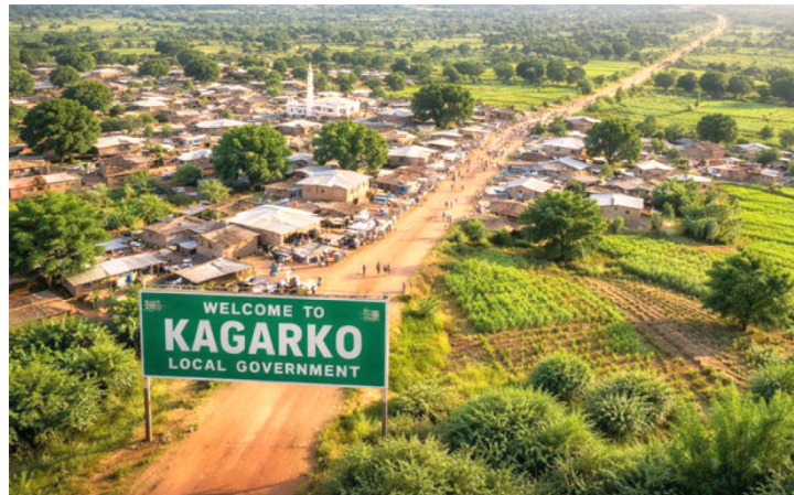
How 13 wedding guests were killed in Kaduna attack