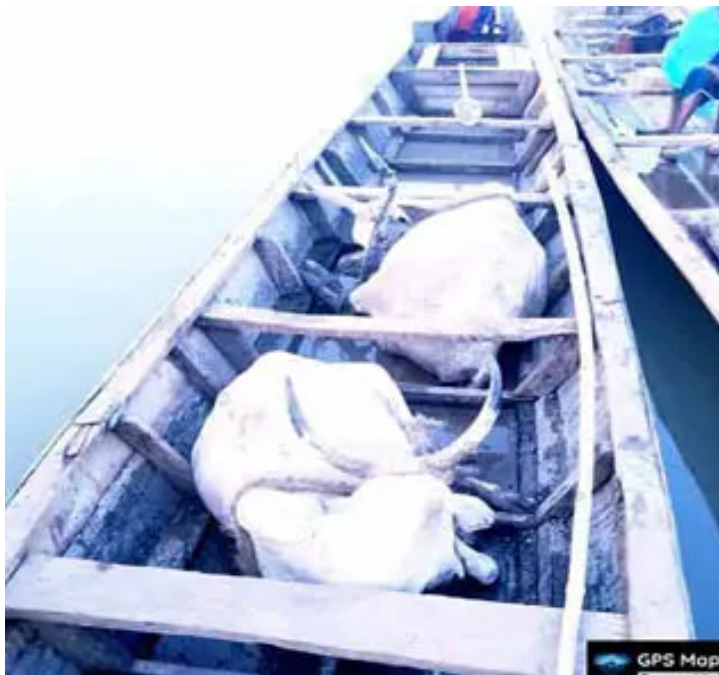
The rustled cows being transported across the river