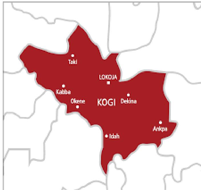
Kogi State Map