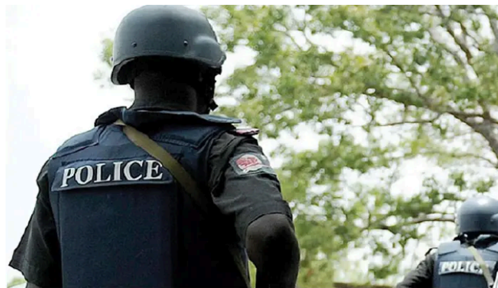
A Nigerian Police Officer