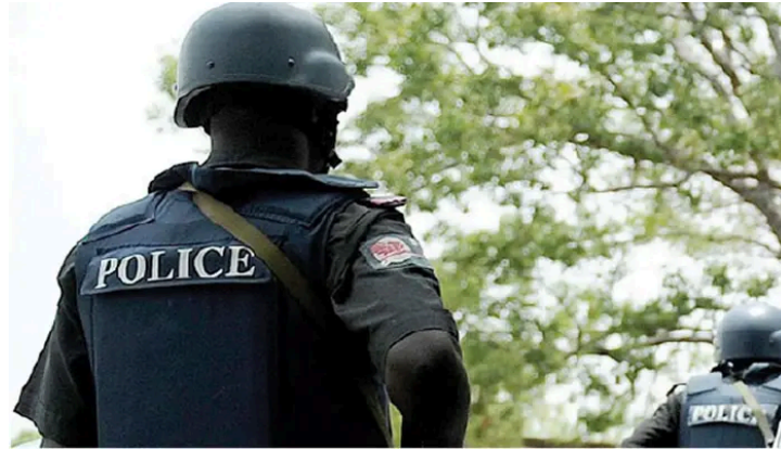
A Nigerian Police Officer