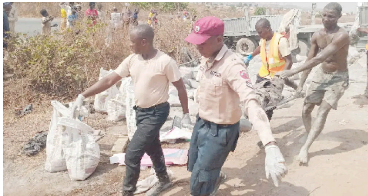
Some of the trapped victims rescued by the Federal Road Safety Corps (FRSC) at the scene of an accident near Kwaita village, along the Abuja -Lokoja highway yesterday