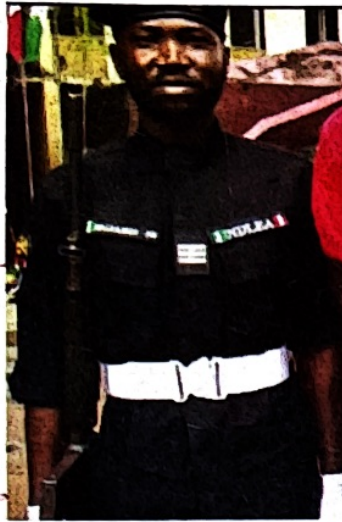
■ The deceased NDLEA officer

"The operation took a tragic turn when Benson mobilized