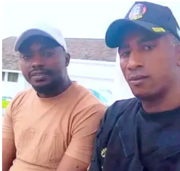
The late vigilantes