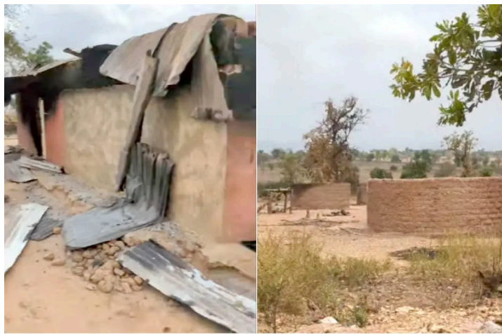
■ One of the houses destroyed