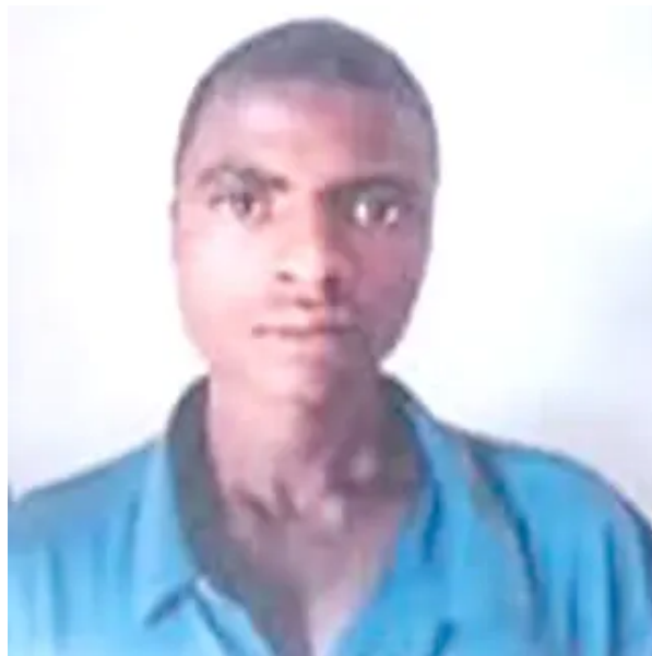
Man allegedly kills father's stepmother in Jos